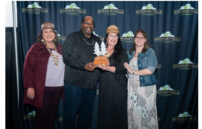
Home Based Business of the Year: Spot to Spot Mobile Detailing