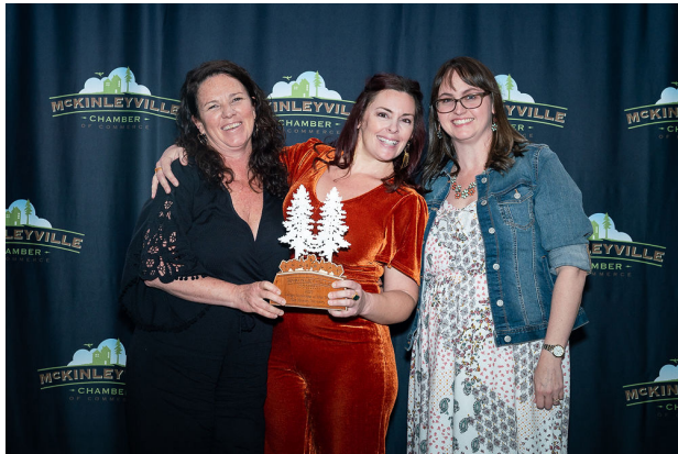
Large Business of the Year: Six Rivers Brewery