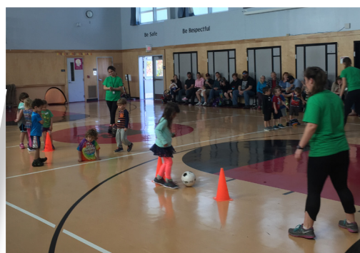
Tot-letics information on Page 13!