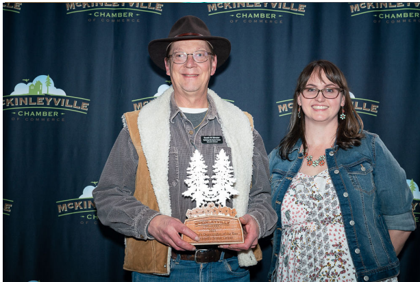
Non-Profit/Organization of the Year: McKinleyville Senior Center