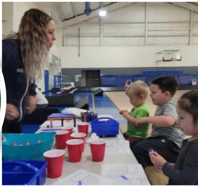
Tot-Camp, Specialty Camps & Teen Summer Takeover Camp information is on Page 14!

See this Summer's Full Line Up on Page 11!