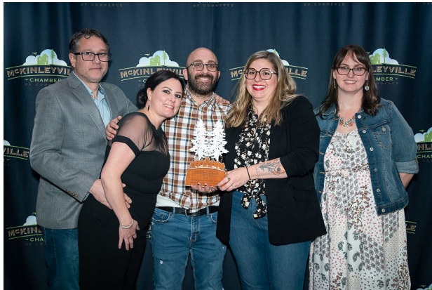
Outstanding Customer Service: Redwood Community Pharmacy