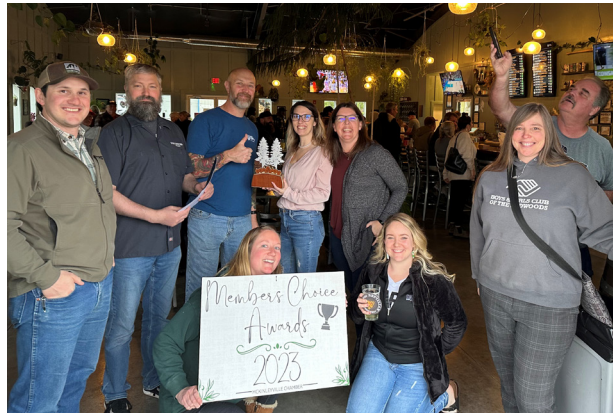
Small Business of the Year: The Bigfoot Taproom